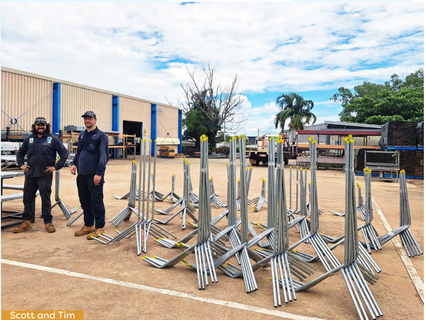
Scott and Tim

* Durable * Long lasting * High flow * Large area coverage * Can water over small shrubs